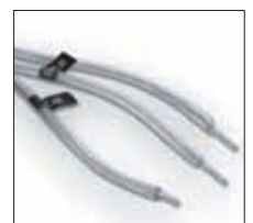
Mounting options: car and display