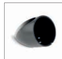
Tilted mounting frame: Easy to install